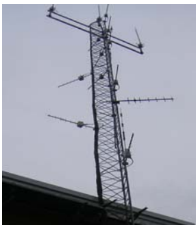
Orange County Communications