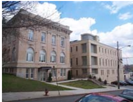
Belleville Municipal Center