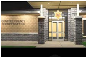
Genesee County Sheriff