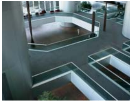
NJ State Justice Center

Intertech Associates is a full service Professional Engineering firm specializing in all aspects of Public Safety consulting – communications, technology, and security design. Our services include design of radio; Dispatch Center/PSAP consolidation, upgrade, and relocation; CAD/RMS; E9-1-1, Wireless 9-1-1, and Reverse 9-1-1; telephone and technology infrastructure; data and network security; long- and short-haul microwave; physical security systems; and building standards and controls for Dispatch facilities.